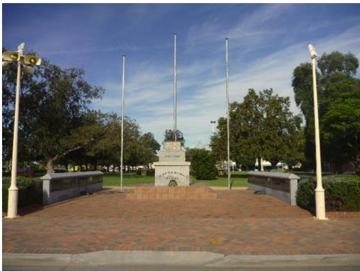
Forbes Cenotaph